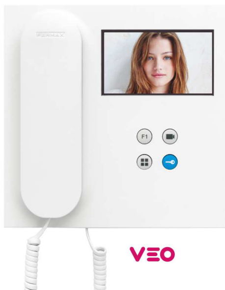
Dimensions: 200x 200x23 mm (44 including handset)