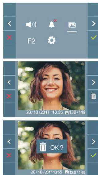
Automatic picture capture when the visitor calls (PHOTOCALLER)

The VEO monitor is made of high-impact ABS plastic. Texturised finish for easy cleaning and ultraviolet protection to get more resistance to the light. VEO incorporates a 4,3" (16:9) panoramic color TFT screen. Its unique handset design incorporating a magnet enables the user to put it back into position correctly when the call is finished. Its balanced design of pure lines is distinguishing, modern and minimal. VEO integrates in the ambience.