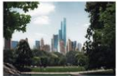
Our 57 building in Grand Park integrates Lynx by Fermax.

For example, with Lynx it is also possible to enjoy home auto-